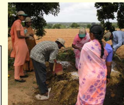
Participants preparing enriched FYM

The art of facilitation was discussed with the participants using role playing method. The details are explained in later sections.