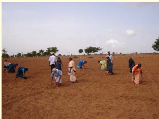
Practice FFS participants making compartment bunds

Practice FFS is being conducted in 45 villages (42 Groundnut and 3 Ragi) in the two districts, covering 868 farmers (773 women and 95 men). The 868 farmers will work in pairs and adopt three neighboring farmers (covering 1302 farmers), to practice their learning with them in small groups.