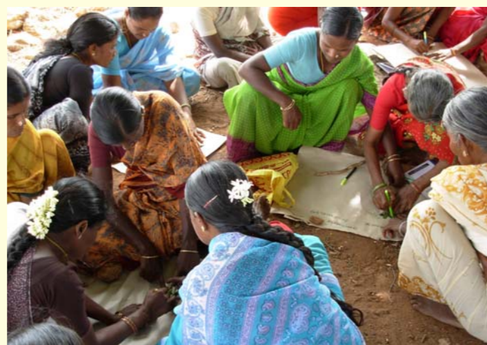
Participants in practice FFS

Groundnut, being a season specific crop in drylands, has to be sown before 15 th July. This minimises the losses due to pests like leaf miner and red hairy caterpillar, excess moisture and processing difficulties during harvest. However, this opportunity could be availed only in 11 out of 45 villages, where sowing could be completed due to early showers during June. In these villages, experiments have been laid out based on participatory decisions, with respect to varieties (TMV 7 and JL 24 being tested against the locally used varieties) and insitu rain water management practices like interception bunds, dead furrows and dust mulching have been carried out.