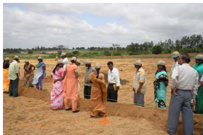
Participants making bunds

Participants prioritised inter bunds, compartment bunds and scooping as viable technologies suited for Groundnut and Ragi cultivated areas, with slopes of 2–3%. They learnt and practiced them in the MToF plot in smaller sub groups.